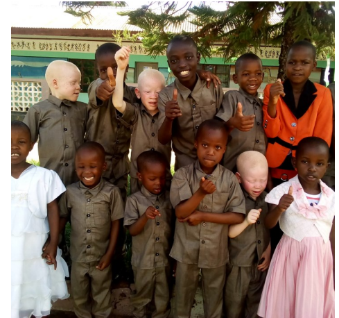
Children at St Martin de Porres Orphanage, Tanzania (June 2021)