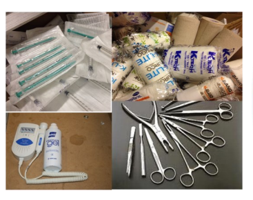
360,462 items of Health Care Goods, valued at £223,929